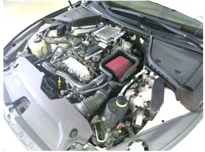
AEM INTAKE INSTALLED (ENGINE COVER REMOVED)