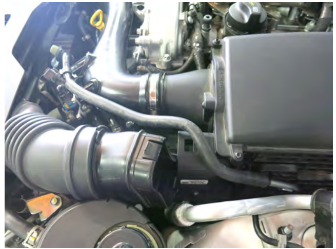
b. Pull the intake scoop from the air box and move it aside.