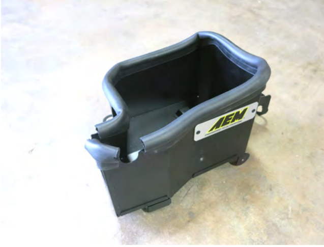
a. Line the upper edge of the AEM air box with the supplied edge trim as shown.