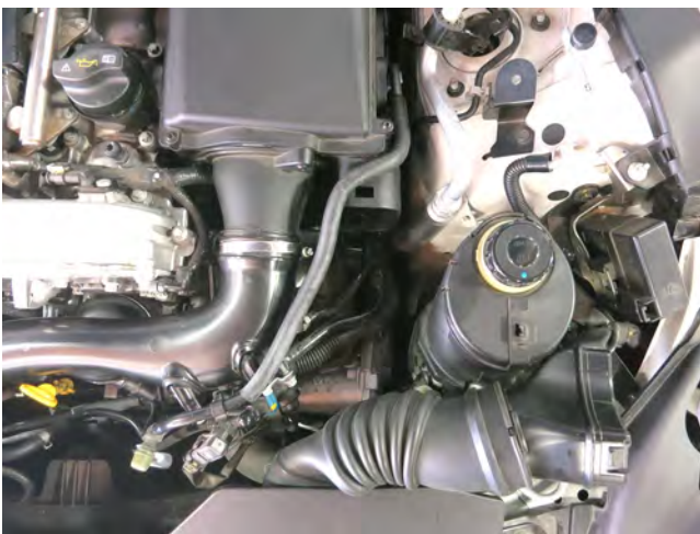
c. Loosen the hose clamp securing the air box to the turbo inlet pipe using a 7mm nut driver.