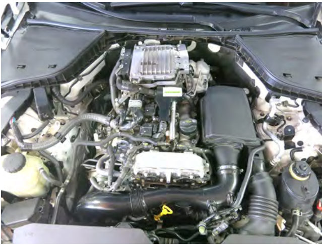
a. Carefully pull up on the engine cover and remove it.