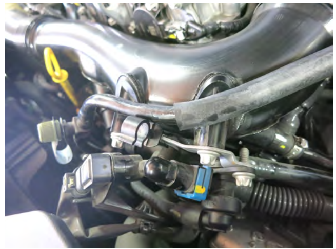
d. Remove the evaporative emissions (EVAP) hardline from the clip.