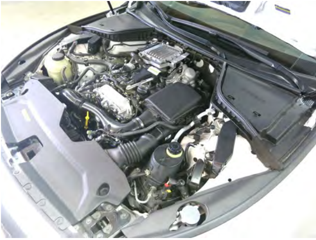
STOCK INTAKE INSTALLED (ENGINE COVER REMOVED)