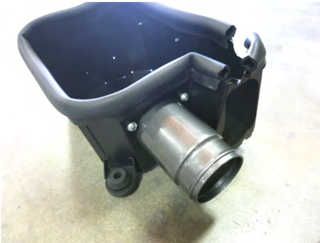
c. Install the intake tube onto the air box with the supplied (3) M6 button head bolts and (3) split lock washers.