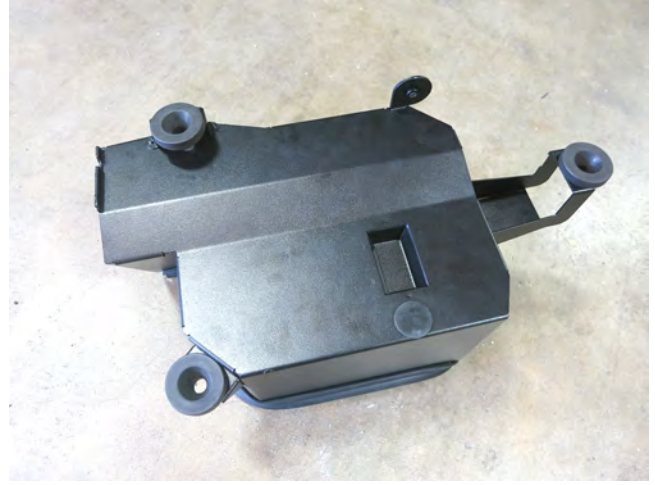
b. Install the (3) grommets removed from the factory air box onto the AEM air box as shown. Also apply the neoprene adhesive pad in the location shown.