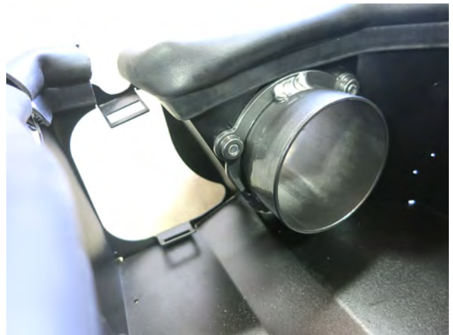
d. Make sure the flat edge on the tube flange coincides with the corresponding edge of the air box.